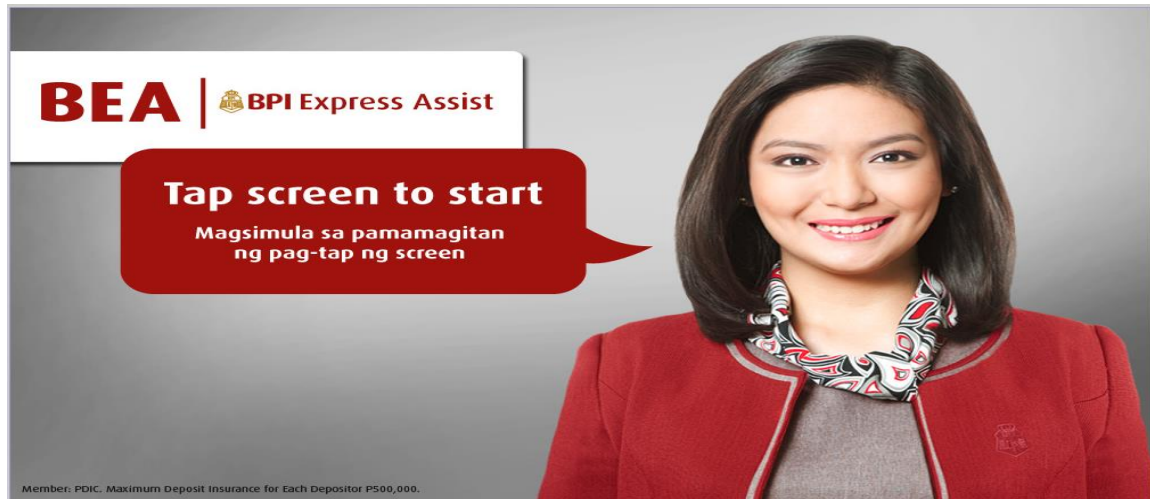
BEA Machine Screen

BEA Machine Queueing Procedure for SBA Payments (Other Merchant)